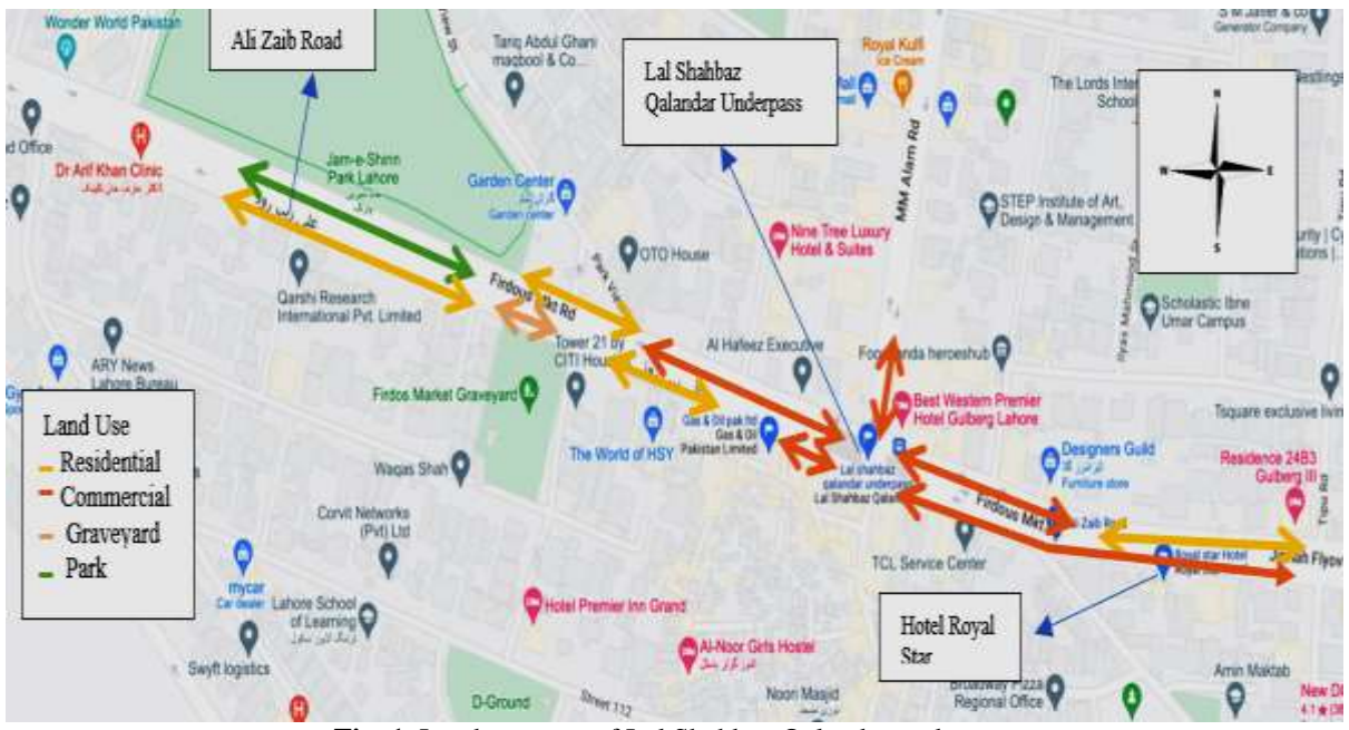
Fig. 1. Land use map of Lal Shahbaz Qalandar underpass

Noise level monitoring was carried out at different locations.